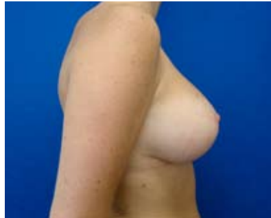
AFTER breast lift required in addition to breast augmentation to correct asymmetry by Dr Norris